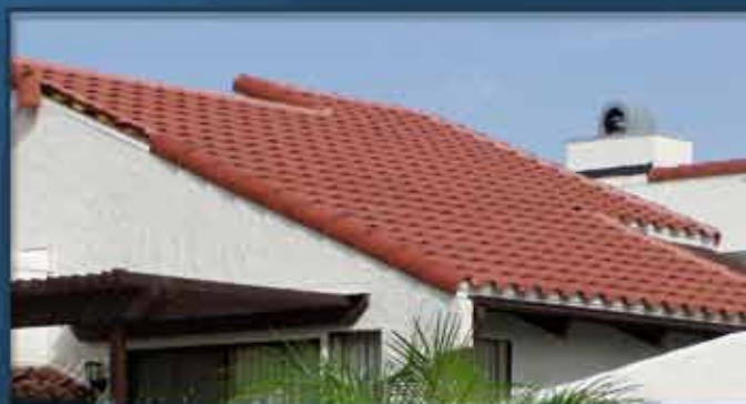
Polyset® large paddy placement; Roof facing East Damage from Hurricane Charley