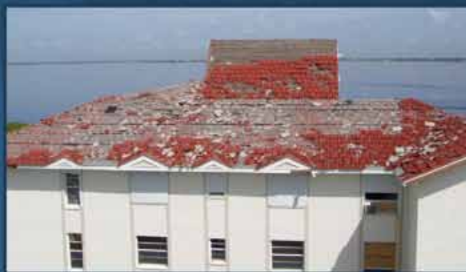
Mortar and mechanical fasteners; Roof facing East Damage from Hurricane Charley

The Burnt Store Marina, pictured above - after Charley's visit - shows how well the Polyset® Professional Tile Roofing System performs, even under such extreme conditions. The tiles on the roofs of the marina are adhered by the polyurethane foam paddies of the Polyset® system, and have been thoroughly engineered and tested to withstand hurricane force winds. The Polyset® roofing system has proven itself time and again, enduring hurricanes and typhoons, keeping roof tiles in place, convincing architects, contractors, building owners and homeowners to request the assurance of performance a Polyset® roof provides.